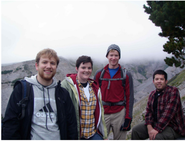
"History and the American West" Field Trip