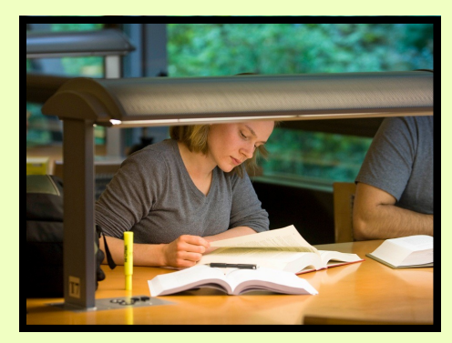
Paul L. Boley Law Library

For the most detailed and up-to-date information regarding courses, syllabi, faculty, tuition, registration, and on-campus housing, please visit our website.