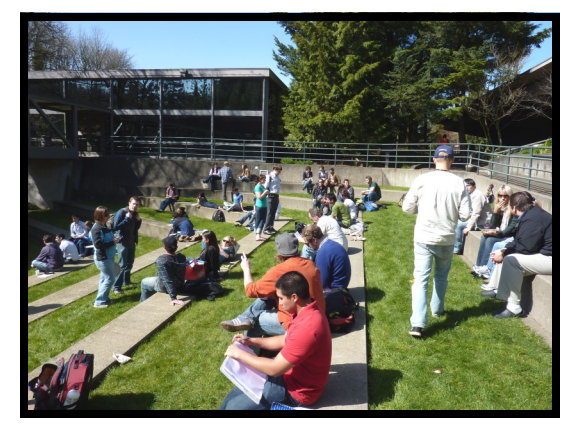
Law School Amphitheater