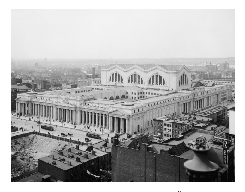
Figure 1: Pennsylvania Station<sup>48</sup>