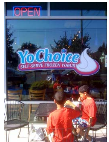
YoChoice Self-Serve Frozen Yogurt