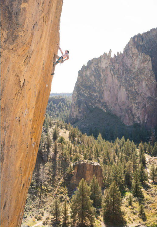
SMITH ROCK STATE PARK—3HRS