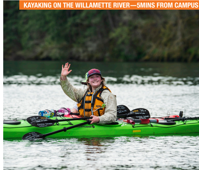
KAYAKING ON THE WILLAMETTE RIVER—5MINS FROM CAMPUS